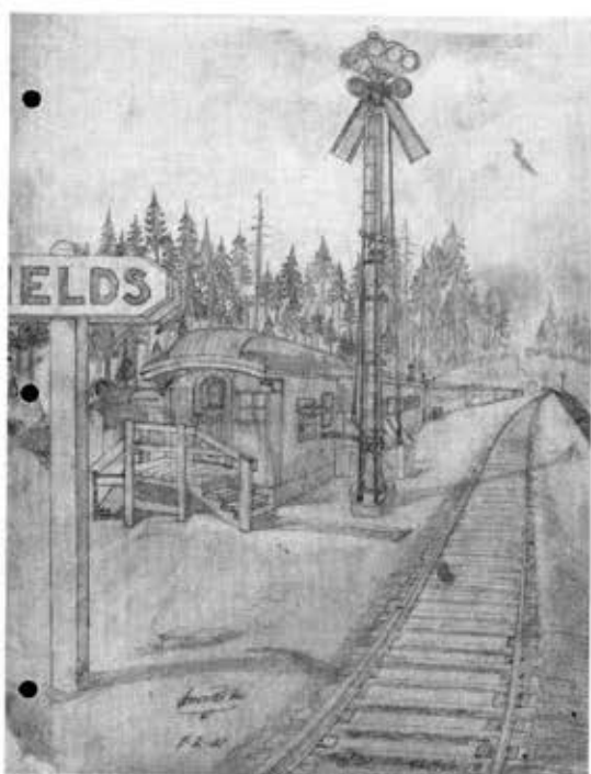
Fields Station, Oregon, 1947. This is a reproduction of the pencil sketch the author made at the time.