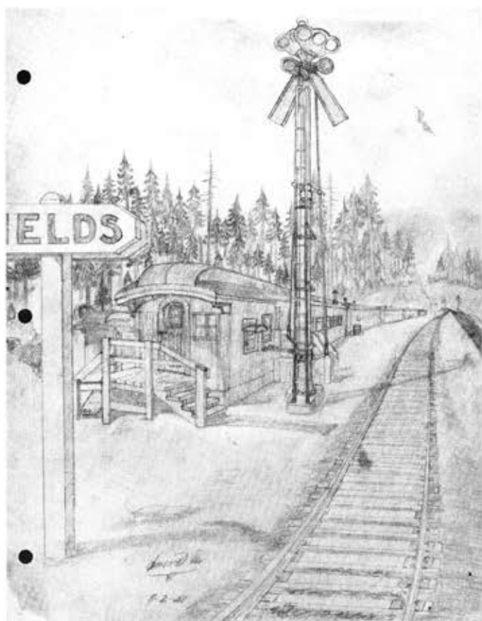
Fields Station, Oregon, 1947. This is a reproduction of a sketch made by the author at the time.

one hundred and eighty degrees. How else are you going to turn a locomotive around?