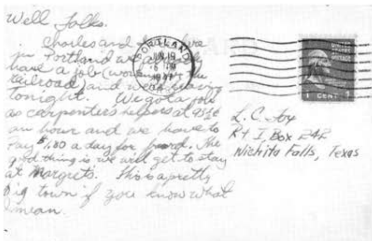
The author's mother never threw anything her son sent her from his many adventures. This postcard, postmarked Portland, was one of the first.