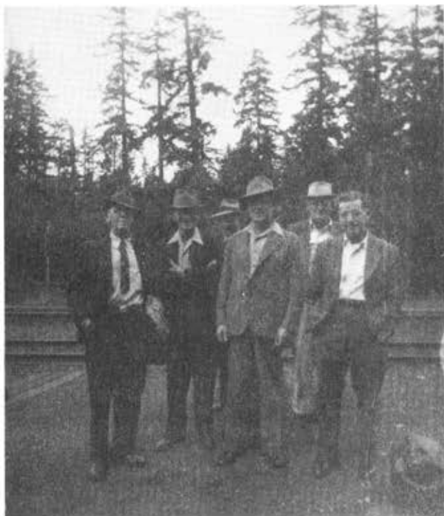
The bridge building gang all dressed up and ready for their regular Saturday trip away from Fields Station. Their railroad passes allowed them to ride free anywhere that the Southern Pacific had tracks.

“Now boys, the thing you want to watch—never hop a car on the back end,” another one joined in. “You always hop onto the front end. If you misgauge the speed of the train and it’s moving a little faster than you thought, well then when you grab the ladder rungs it’ll sling you up against the car.”