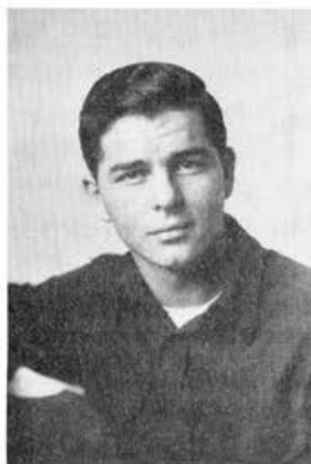
The author, aged eighteen, and please note: no wavy hair.

We were a pair, all right, and when I started to tell second-hand stories about the big money waiting