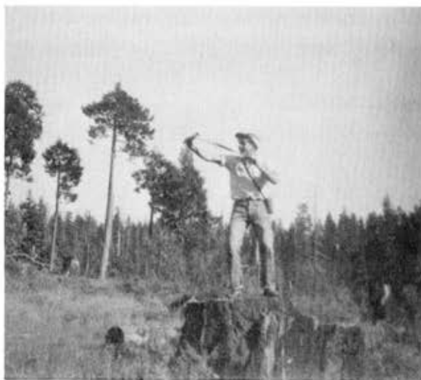
The author, with his slingshot and binocular case, after a hard half day's work at Fields Station.

I was never bored. There was always plenty to fill my time. Hunting with my slingshot was great fun,