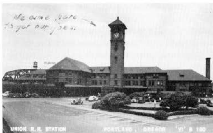
A young man often sent his folks postcards for evidence of his adventures. Note handwritten explanation of the obvious.